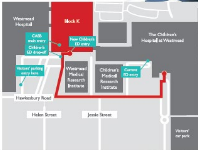
Walking route from our current Hospital to the new building.

Parking is available underneath the building, as well as a 15 minute drop-off and pick-up zone, located outside the front doors.