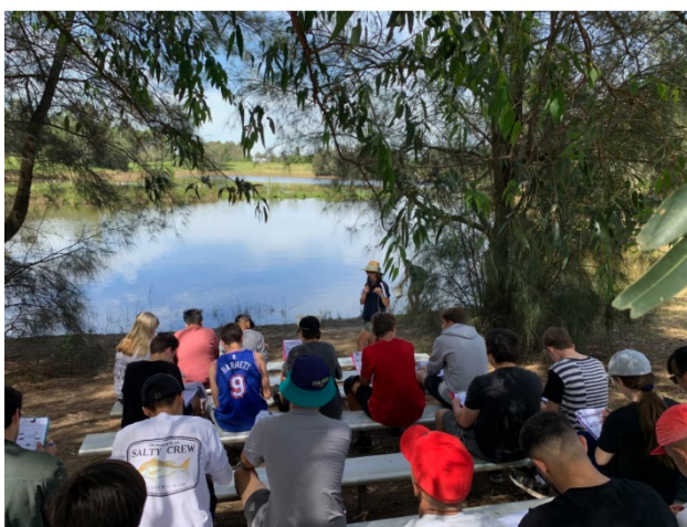
Students attentive and prepared for field work.

This Year 11 Investigating Science class travelled to Penrith Lakes on Monday 2nd March where students conducted a range of hands on, collaborative practical investigations to investigate the health of the ecosystem post mining. This will form part of their first depth study assessment task.