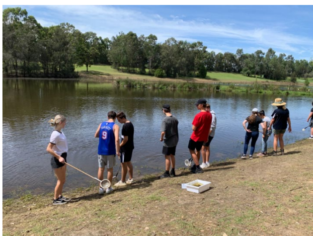
Students completing first hand investigations by performing field work