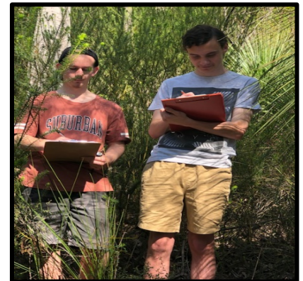
Students evaluating the Bandicoot's environment