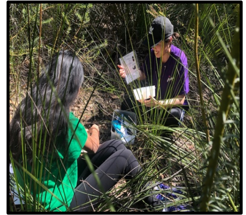
Students evaluating the abiotic factors in the Bandicoots environment

Year 9 have completed two assessments this term and have two more to go for term 4.