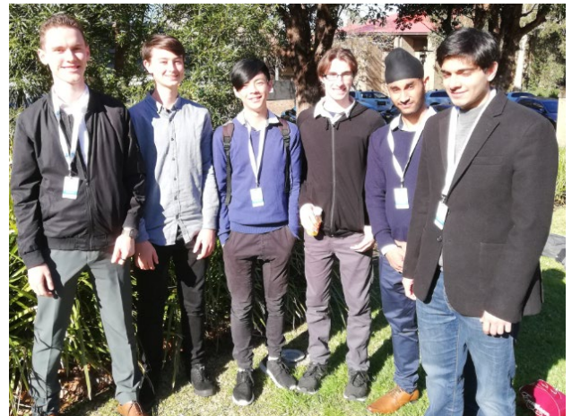
Some of the students who attended the AYAA conference