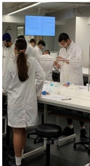
Students focused and enjoying performing practical