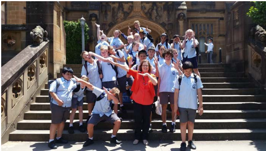
Past group that have attended Spectacular Science at Sydney University

The Spectacular Science excursion will be running again this year on Wednesday the 21 st of November, with 54 Year 7 students from the GAT class and Science Group receiving the first invitations. The excursion takes place at Sydney University where students will participate hands-on science activities such as catching creepy-crawlies amongst the scrub, use a microscope to see the animals in the finest detail and map the relationships between these tiny animals. Also students will learn the chemistry of making slime, and will freeze a range of materials in liquid nitrogen and smash them. They will also meet real scientists who'll share what they are discovering about the world around us.