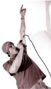
JOIN NOW! Singing Group URBAN SOUL for Teens 12yrs-over