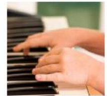
JOIN NOW! Piano Lessons for all ages