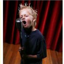
JOIN NOW! Solo Singing Tuition for all ages