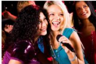
JOIN NOW! Singing Group MOST WANTED for young women 16yrs-30yrs