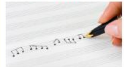
JOIN NOW! HSC Music Theory Course